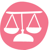
Legal Aid Service Providers