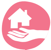
Civil Society Organisations